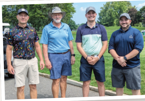
2nd Place: Park National Bank