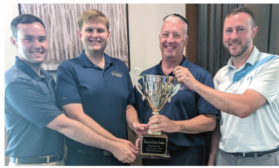
1st Place: Roberts Funeral Home