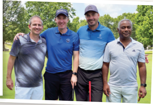
3rd Place: GOJO Industries Inc.