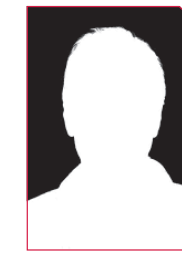
VIP, Name to be soon disclosed