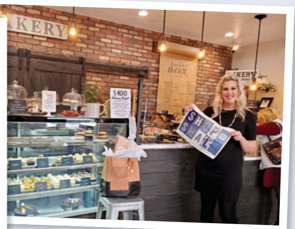
The Chamber staff thanks you for shopping local all year long!