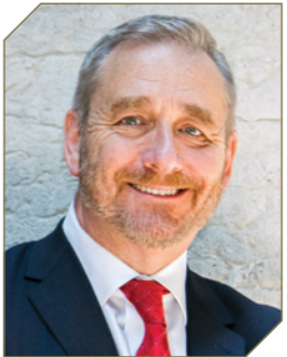
Dave Yost State of Ohio's 51st Attorney General