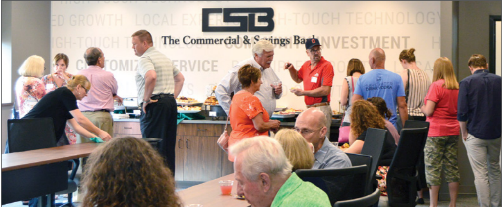
Chamber members mingle while touring the new Commercial & Savings Bank location in downtown Wooster.

Thank you to CSB for hosting the event and Buehler's Catering for providing refreshments.