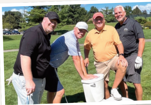
2nd Place: Whitaker Myers Group