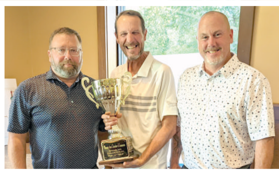
1st Place: McElroy Packaging