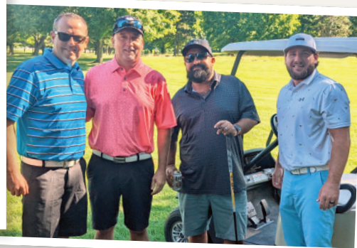
3rd Place: Compak