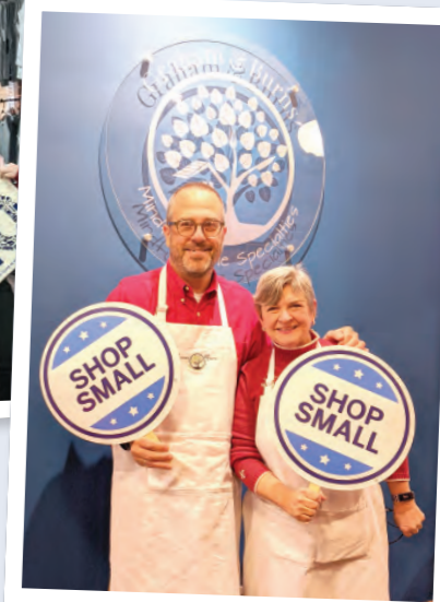
The Chamber staff thanks you for shopping local all year long!