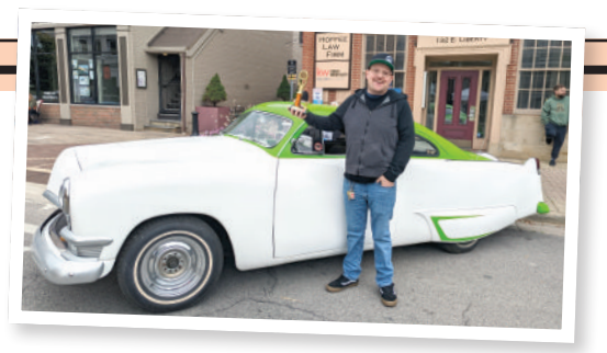
Woosterfest 2022 Cruise-In Winner