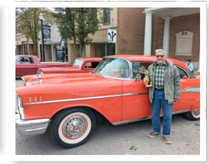
Woosterfest 2022 Cruise-In Winner

Save the Date for the 2023 Woosterfest – Friday, Sept. 29 and Saturday, Sept. 30! Thank you to all of our 2022 Woosterfest event sponsors!