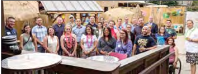
YP's gathered for an evening of networking at Flamingo Jack's new outdoor patio.

The Young Professionals gathered at Flamingo Jack's on Wednesday, August 1st. Flamingo Jack's provided their famous watermelon salsa for attendees to enjoy while networking and reconnecting with friends. We want to express our gratitude and appreciation to Flamingo Jack's for hosting a wonderful evening.