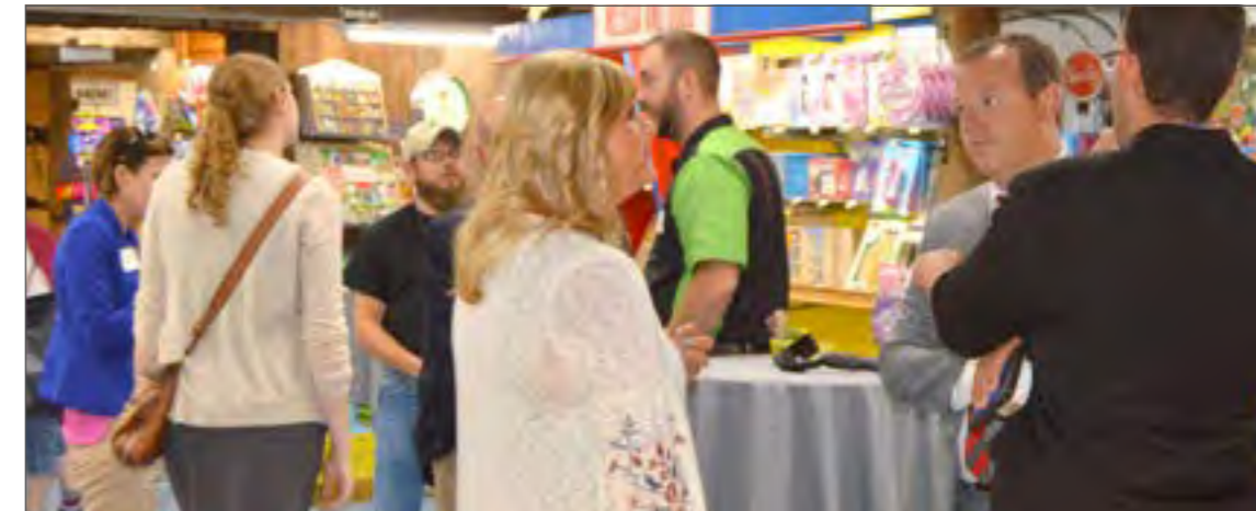
Wooster Chamber members joined together at Lehman's on August 16th.

Members spent some of their evening learning all that Lehman's has to offer. Guests enjoyed some of the 300 flavors of soda Lehman's carries, grilled pineapple and chicken, Lehman's homemade ice cream, and much more! We would like to express our gratitude to the Lehman's team for hosting such a great event for our members.