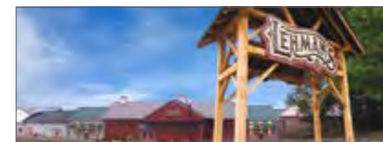
Lehman's - we've been selling history for over six decades.