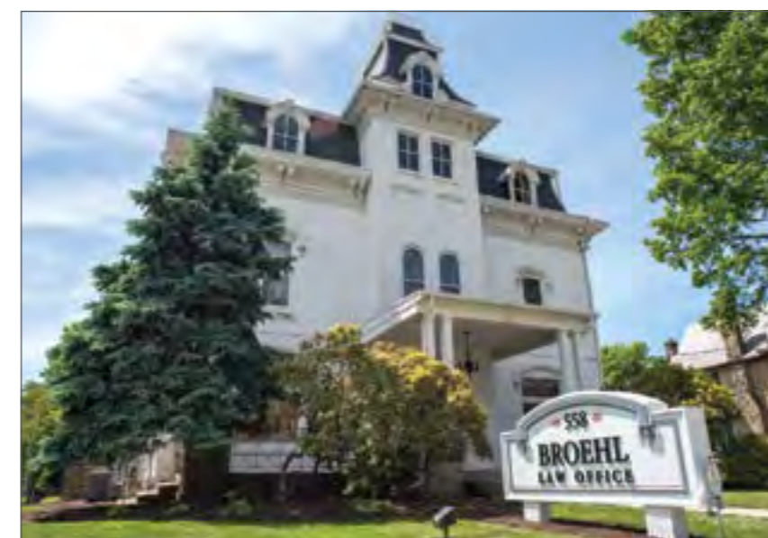
Join us at the beautiful and historic Annat Mansion on October 30th!