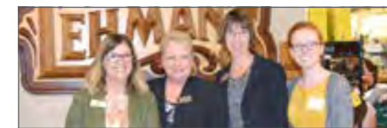
St. Paul Hotel staff join together at the August Business After Hours for an evening of camaraderie.