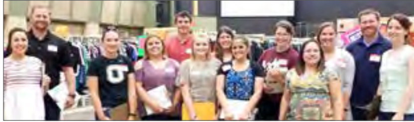
Volunteers generously spend their evening helping students pick out back to school clothes.