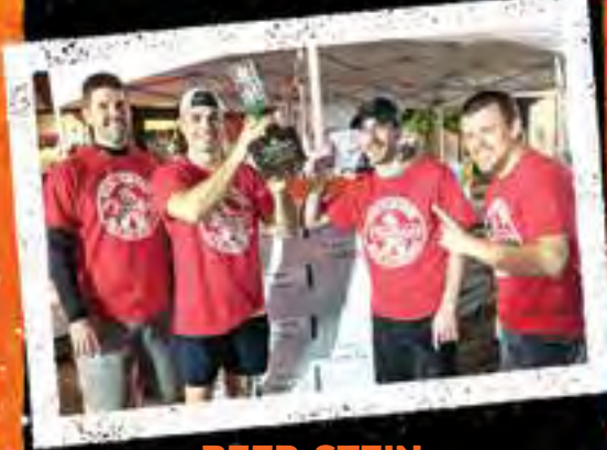
BEER STEIN RACE WINNER BCI BUCKEYE DIVISION