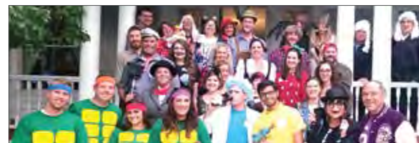
Wooster Young Professionals gather at Long, Cook and Samsa for the 2017 costume party.

Join us for a frightfully good time at the annual YP Costume Party at Long, Cook & Samsa on Tuesday, October 23rd from 5:30-8 PM! Prizes will be awarded for best costume so come dressed to impress. You won't want to miss this one!