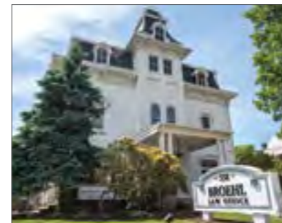
Join us at the beautiful and historic Annat Mansion on October 30th!

The Broehl Law Office welcomes you to join us in the historic Annat Mansion for Business After Hours on Tuesday, October 30th from 4:30 PM- 6:30 PM! Come be amongst friends and network with business professionals within our community. Savor sweet treats featuring a dessert bar provided by Miss Amy's Bakery and the Cookie Snob, as well as a delicious ice cream sundae from Dairy Queen of Wooster. Drinks and spirits are being supplied by Bowman Beverage. Enjoy a tour of the renovated building, marvel at unique antiques, enter to win door prizes and celebrate camaraderie! We look forward to seeing you!