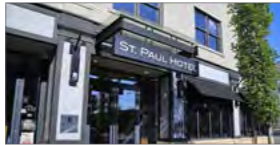
On Community Development Day, Leadership Wooster students were given the opportunity to tour the St. Paul Hotel in Downtown Wooster.