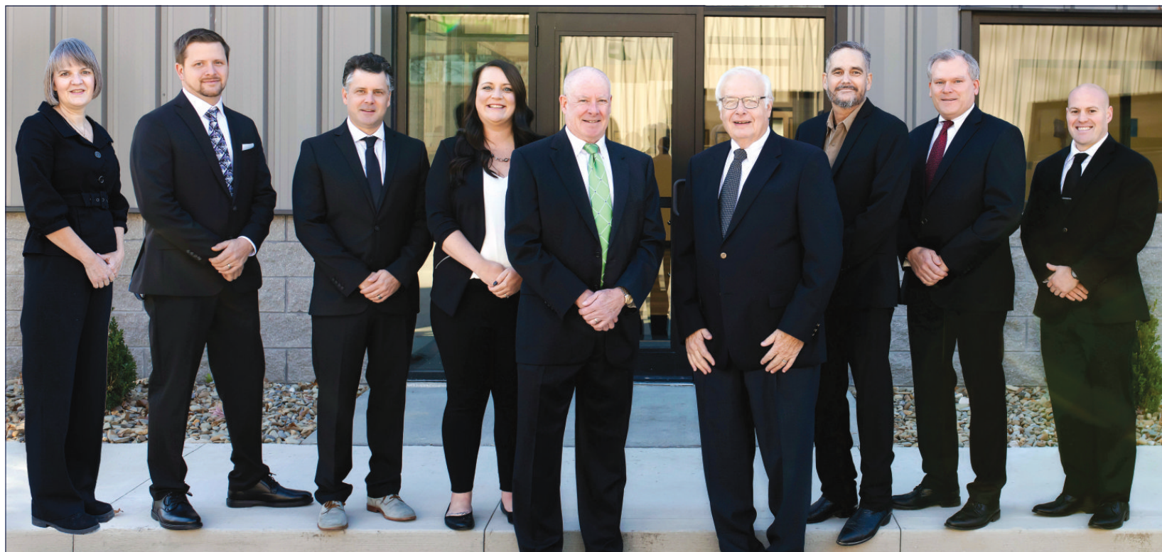
With over 870 business professionals in attendance, the Wooster Chamber honored the 2024 Award Recipients. Thank you to everyone who attended to recognize these outstanding businesses and individuals.

Thank you to our 124th Annual Dinner Sponsors: