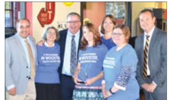
The 2017 Small Business of the Year award for 15 or fewer employees was awarded to Broehl Law Office LLC.