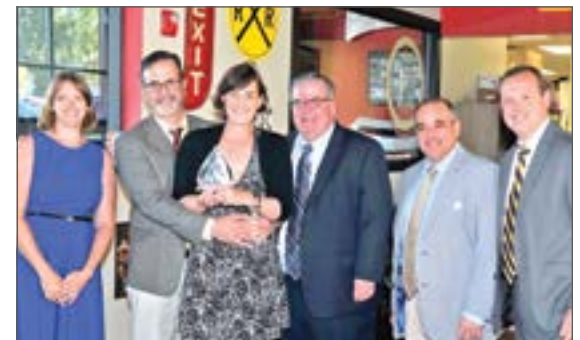
The 2017 Small Business of the Year award for 15 or more employees was awarded to Pine Tree Barn.