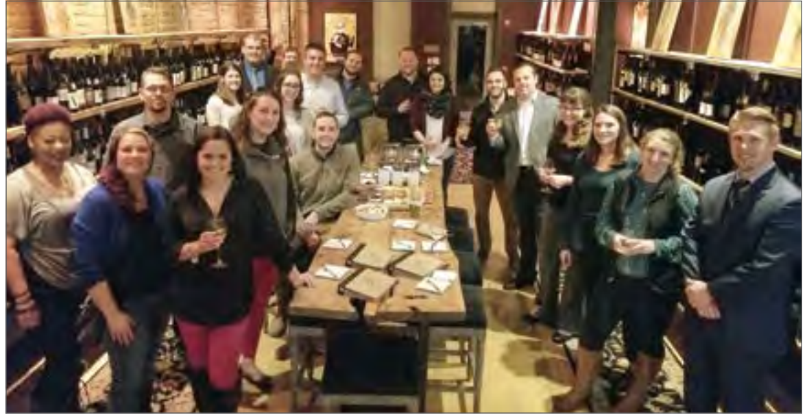
YP's enjoying their evening at H2.