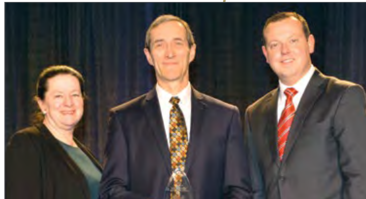
MCTV Board of Directors Award