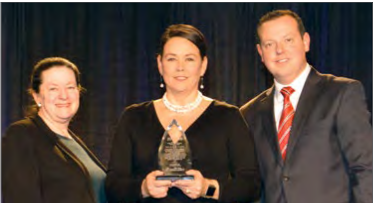
WAYNE COUNTY CHILDREN'S ADVOCACY CENTER WorthyWorks Award