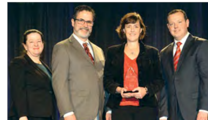
PINE TREE BARN Small Business of the Year – More than 15 Employees