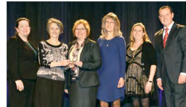
BROEHL LAW OFFICE Small Business of the Year – 15 Employees or Less