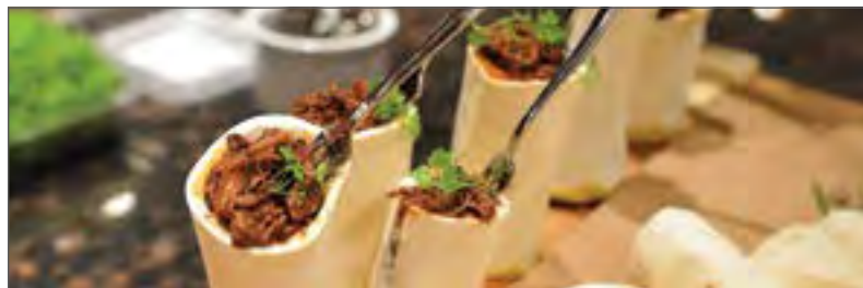
Join us on Feb. 28th for a Business After Hours at the CAB Culinary Center.

The night will feature hors d'oeuvres, drinks, meat cutting demonstrations, the Black Hide Collection™ store and a glimpse of the brand's journey, as it paints 40 barns across the country to honor its ranching heritage.