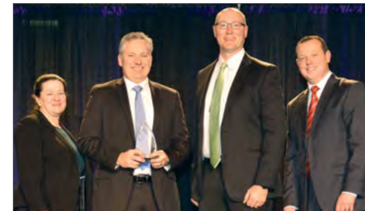
SCHAEFFLER Business of the Year