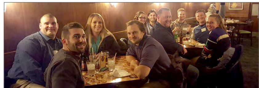
Wooster Young Professionals gather at Coccia House for the 2017 end of the year YP event.