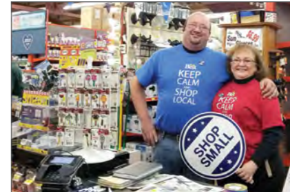
Tignor's Hometown Hardware was prepared with great deals and of course some really cool shirts this Shop Small Saturday!