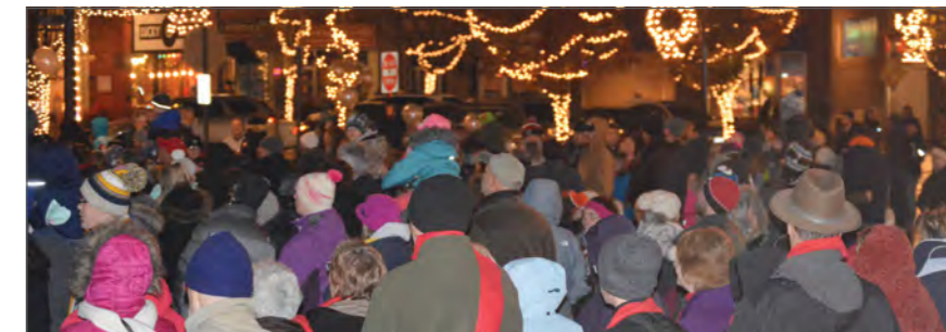
A large crowd is on hand at the 2018 Window Wonderland in Downtown Wooster on Friday, November 16!