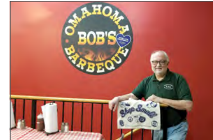
Beef jerky makes a great stocking stuffer! Visit Omaha Bob's in Downtown Wooster for the best traditional Texas style BBQ!