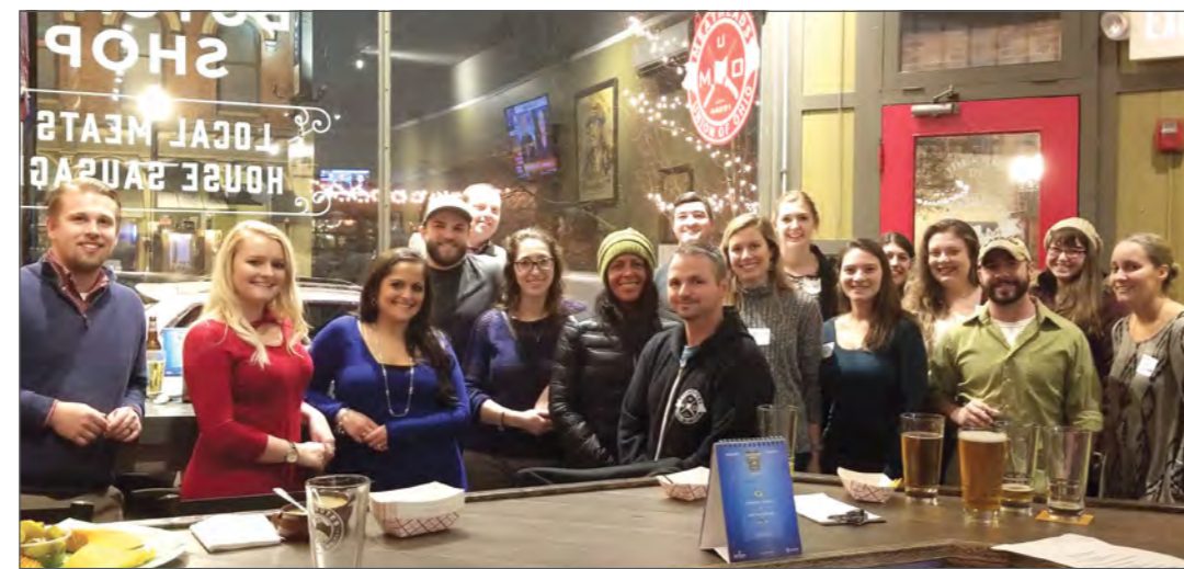
YP's gathered for an evening of networking at Meatheads new bar in Downtown Wooster.