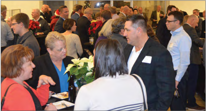
Chamber members network at the 2017 Huntington Bank Business After Hours in Downtown Wooster.