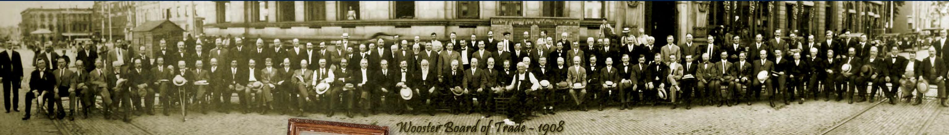
Wooster Board of Trade - 1908