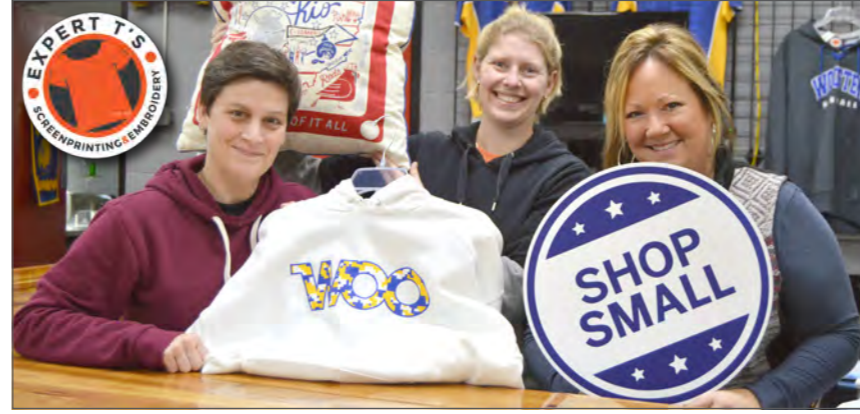
Wooster Expert T's staff gather together for 2018 Shop Small Saturday.