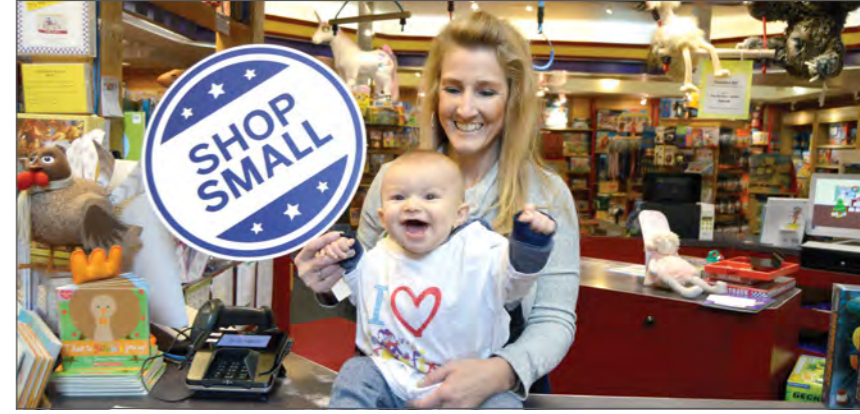
Toyrixfix celebrates 29 years in business in conjunction with Shop Small Saturday!