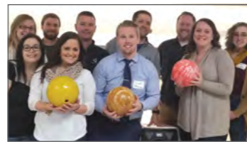
The Wooster Young Professionals at Wayne Lanes for a casual evening of bowling & networking.

Join us for an evening of bowling and mingling with the Wooster Young Professionals at Wayne Lanes on Wednesday, January 16th from 5-7 PM. This is a fun and casual way to meet and network with other YP's in the area! Games will be $2 (including shoe rental). Appetizers will be provided, and a cash bar will be available. Bring a co-worker, and join the fun!