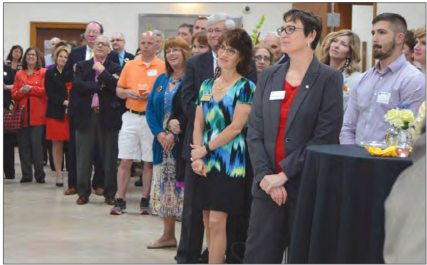
Members gather to network and celebrate camaraderie at a Wooster Chamber event.