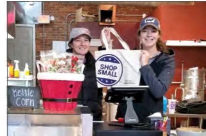
Holcomb's Classics is located on North Market Street in Downtown Wooster. Stop by this holiday season to show your support!