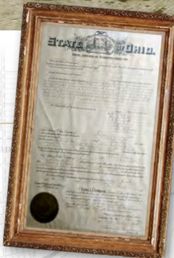
Incorporation of the Wooster Area Chamber of Commerce in 1908.

The Wooster Area Chamber of Commerce, known as The Wooster Board of Trade in early years, has been a leader in Community and Economic Development efforts in the Wooster area for more than 125 years. The current Board of Directors and Staff of the Wooster Chamber are honored to be part of an organization that continues to be a leader in advancing the Community well into the 21st Century. Officially, founded as an organization on December, 14th 1908 the Wooster Chamber is proud to share moments of our first 50 plus years as an organization. Most recent year accomplishments will be outlined in future newsletter editions.