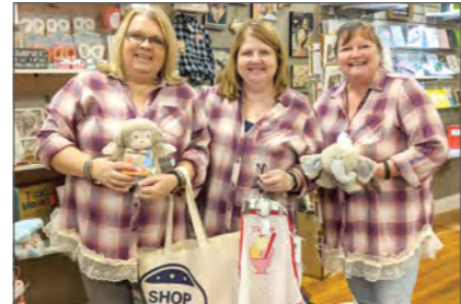
Shopping in style! These ladies stopped by JK Gift shop to show their support on Shop Small Saturday!