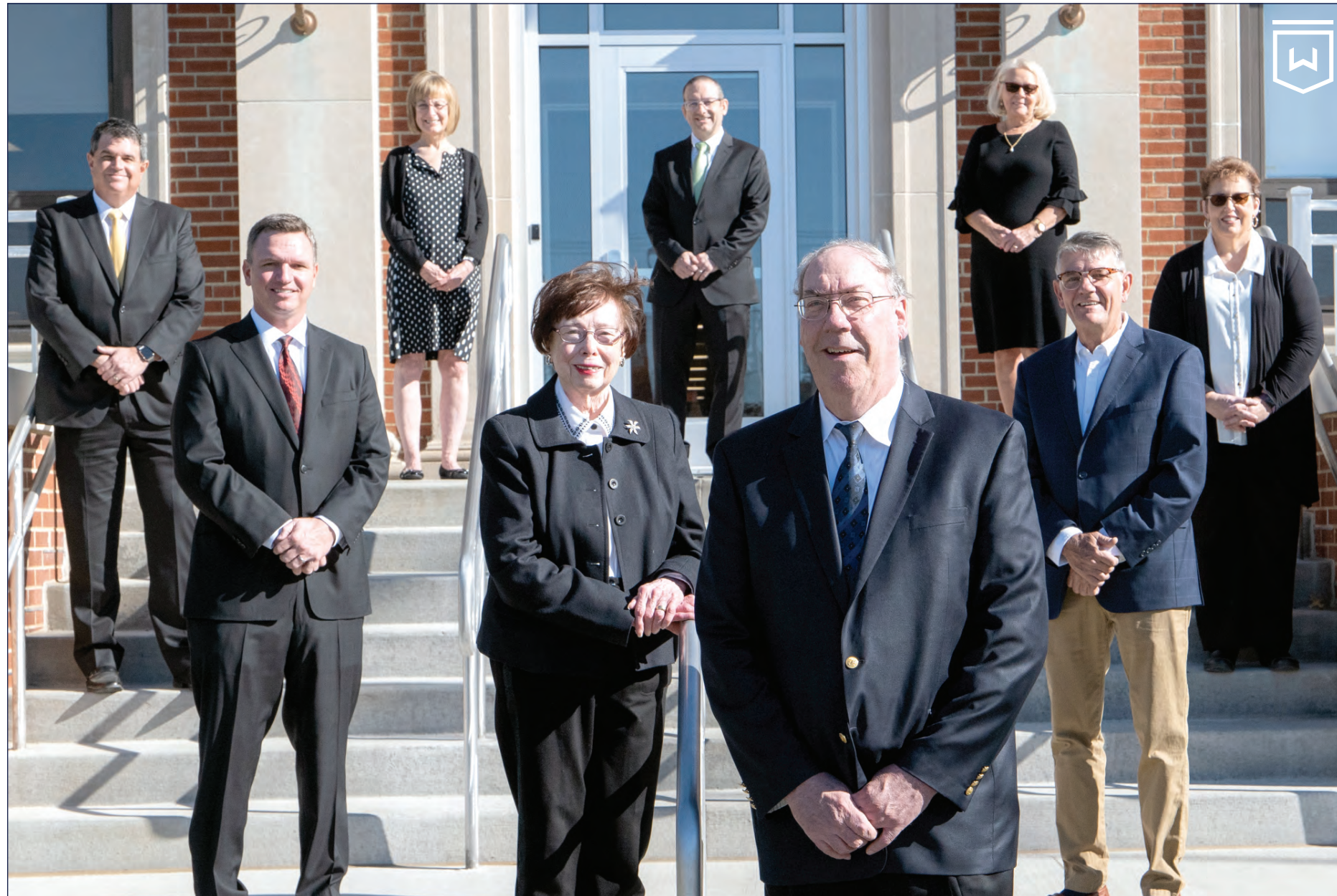
The Wooster Area Chamber of Commerce is pleased to recognize the 2021 Award Recipients.