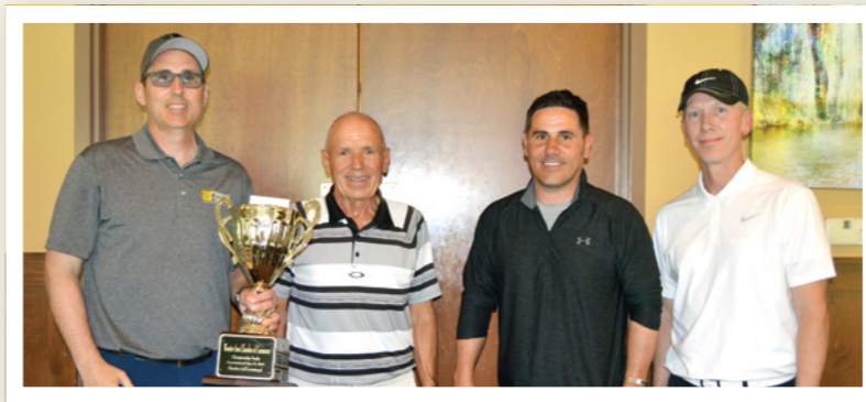
The 2019 Chamber Golf Outing Champions, Wayne Savings Community Bank.

Friday, May 15, 2020 · Wooster Country Club · 1251 Oak Hill Road, Wooster