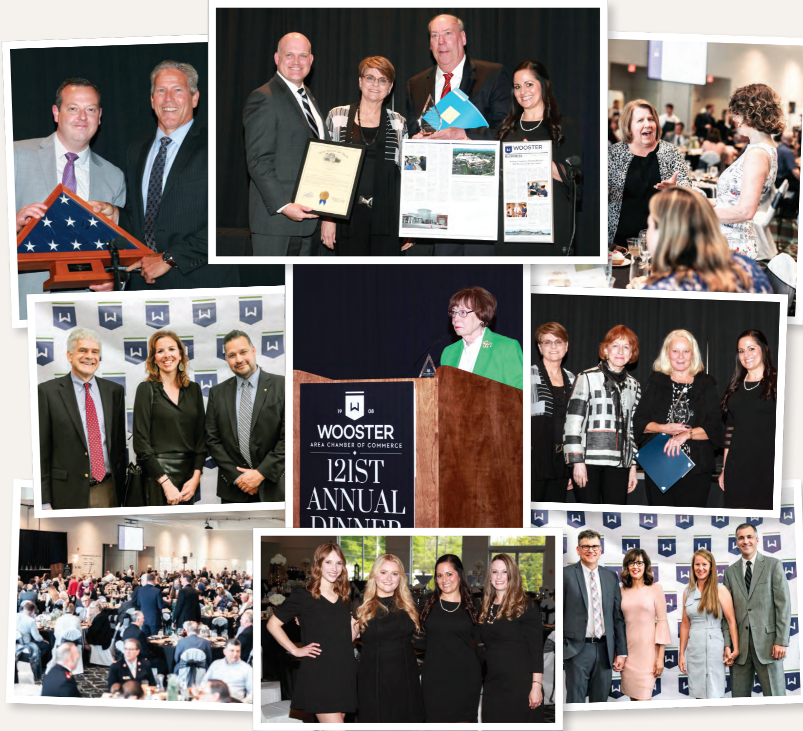
Thank you to everyone who joined us and celebrated our award recipients!