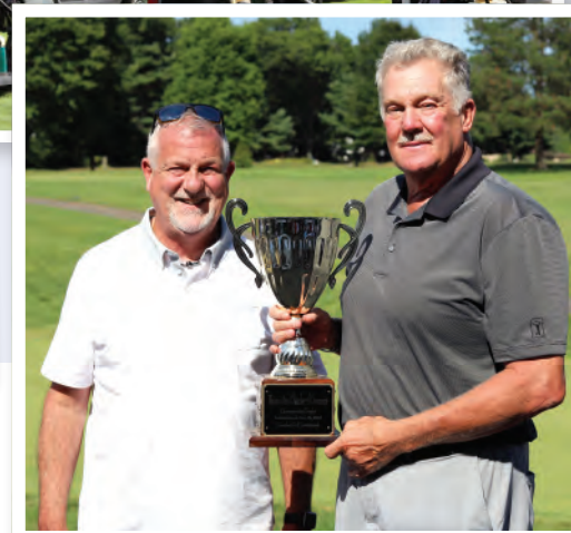
The 2020 Chamber Golf Invitational Champions, Park National Bank