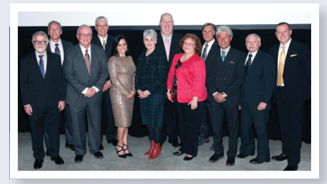
January 2020 Annual Dinner program Award Recipients

woosterchamber.com Wooster Area Chamber of Commerce