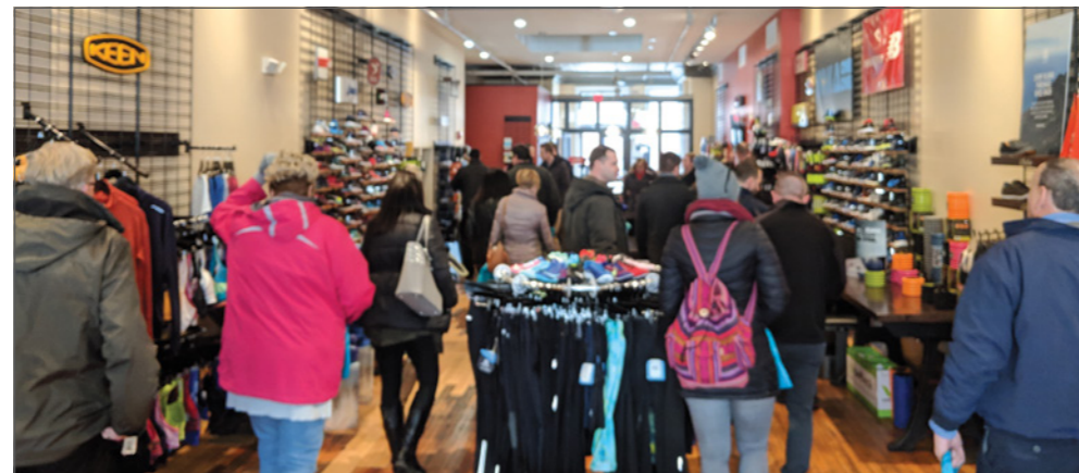
Class members gather at the new Vertical Runner space located on West Liberty Street.