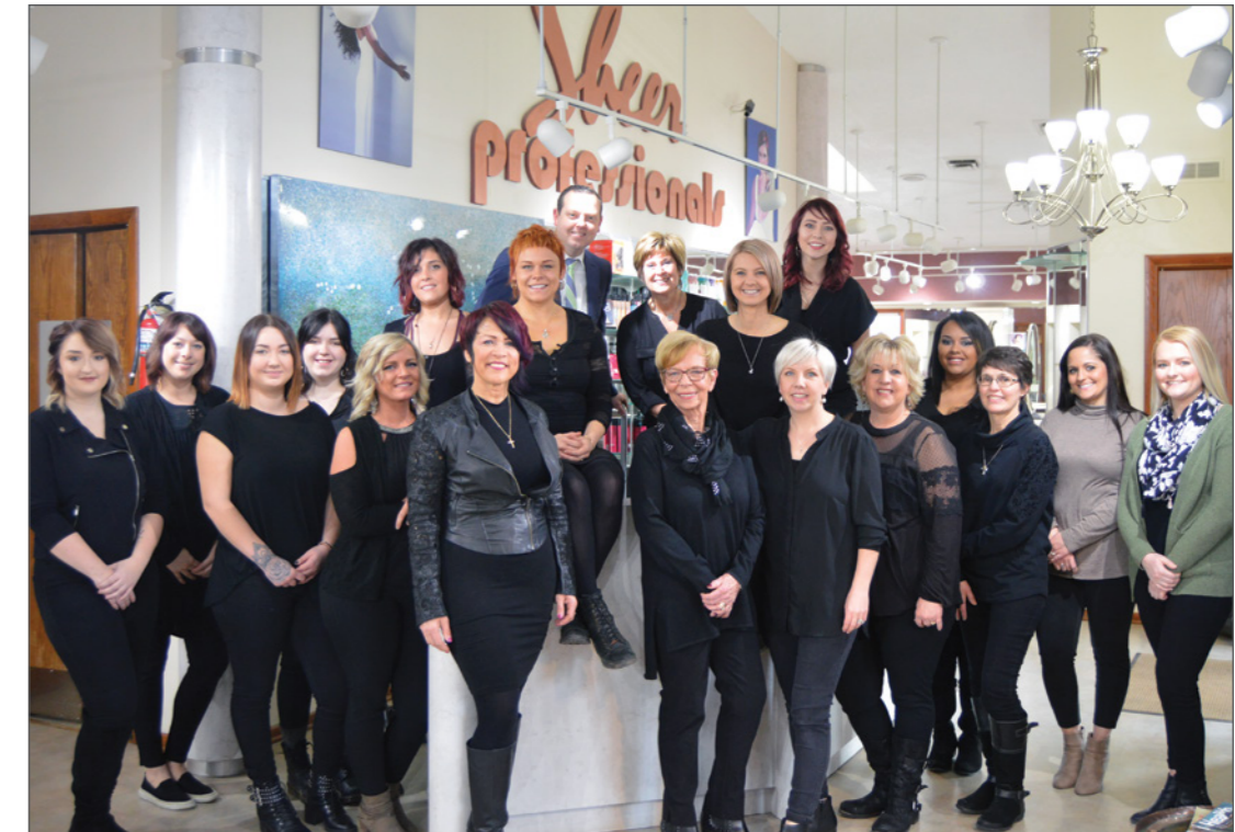
The Sheer Professionals team proudly pose with Chamber staff for a photo in their salon on Cleveland Road.

All members of the Sheer Professionals team go through an extensive apprenticeship program, learning various techniques from staff members. The staff at Sheer Professionals believe in more than just hairdressing. They believe their vehicle is hair, but their mission is to change lives. Stop in or give them a call today!