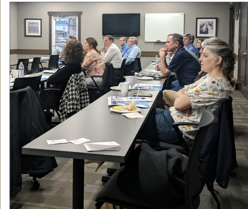
Representatives of Wooster Chamber members gather for the first Educational Series of the 2019 year.