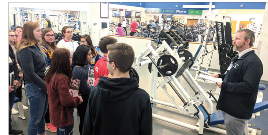
Wayne County Students receive a behind the scenes tour, showing the various services and offerings at HealthPoint in Wooster.