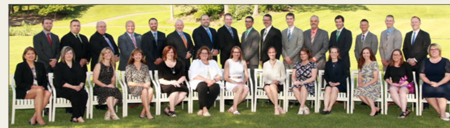
Leadership Wooster graduation class of 2018

Leadership Wooster is the Chamber's premier leadership program designed to identify leaders and motivate them to take a leadership role in the community. Now in its 23rd year, and with an alumni network totaling over 600, the program has become a network of business leaders who contribute to the area through a variety of ways including volunteering and serving on boards of local agencies.