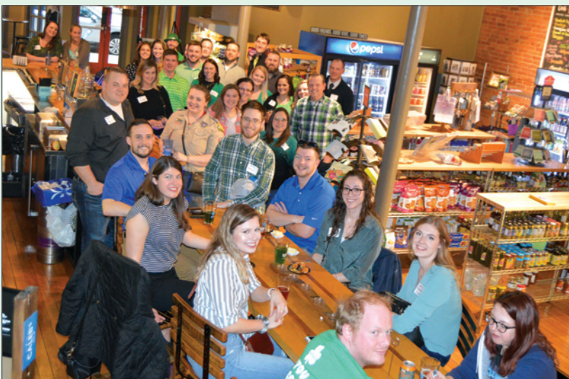
Over 30 Wooster Young Professionals gathered for a pre-St. Patrick's Day celebration at Spoon Market!