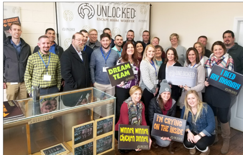
Leadership Wooster students use their leadership and communications skills, attempting to escape the Unlocked Escape Rooms here in Wooster.